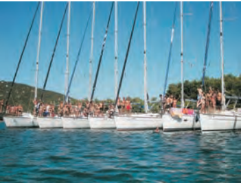
Shared yachts with cabin charter