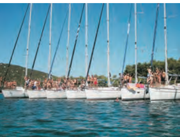
Shared yachts with cabin charter